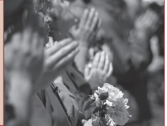
Nyingma Community Members Praying