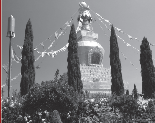
Odiyan Enlightenment Stupa

“Prayer is deeply nourishing to the human heart and mind; it awakens aspiration for beauty and truth, and opens inner pathways through which knowledge can manifest in our lives.”